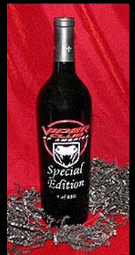
VPR-6001 – VCA Wine - $69.95 each

Production is limited - Only 250 bottles will be made - each consecutively numbered. The perfect gift for the holidays! Includes gift box and decorative stuffing.